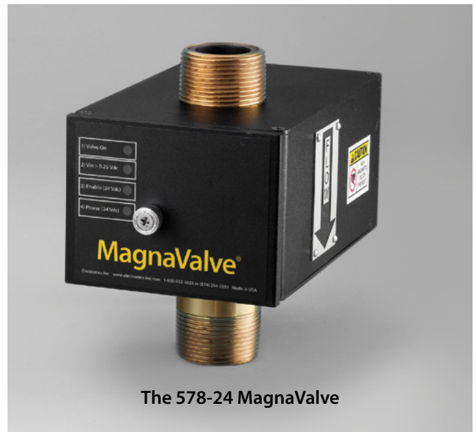
The 578-24 MagnaValve

Clear and comprehensive installation manuals simplify installation for the 24 Vdc Series MagnaValves and the FC-24 Controller. In addition, the products are supported by the Electronics Inc. application engineering staff.