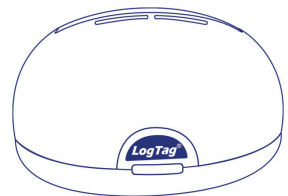
LTI-WiFi Not Included