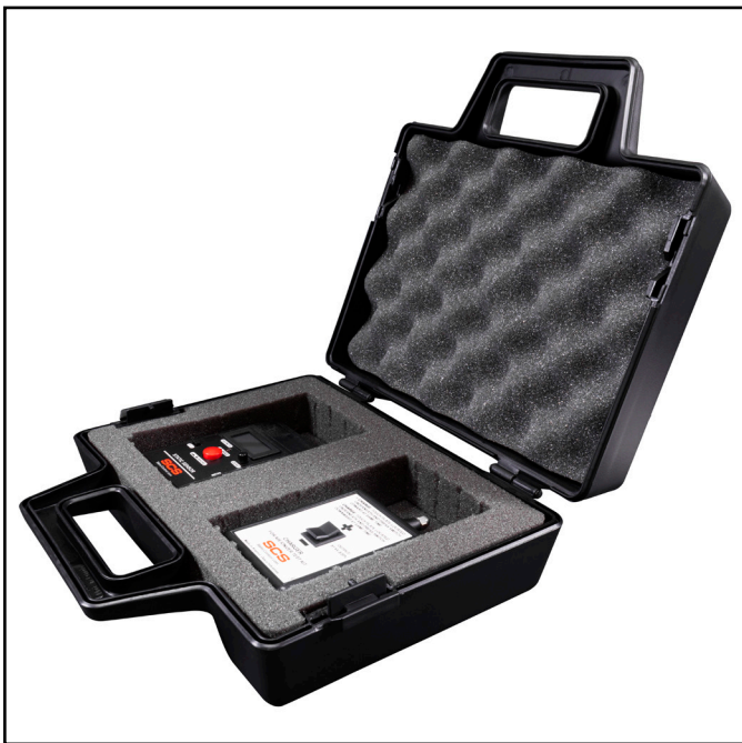
Figure 3. Air Ionizer Test Kit and Carrying Case