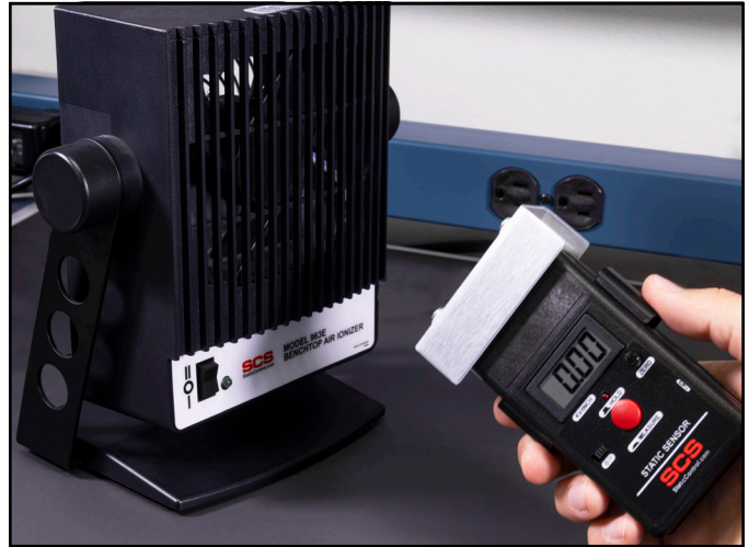
Figure 9. Using the Static Sensor with Conductive Plate to measure the offset voltage of a benchtop ionizer

NOTE: When testing pulsed ionizer systems, the voltage displayed is constantly changing. This pulse rate may be faster than the display update rate of the Static Sensor, therefore the displayed voltage is an average of the actual voltage. The output of the Static Sensor is useful in this situation for more accurate measurements.