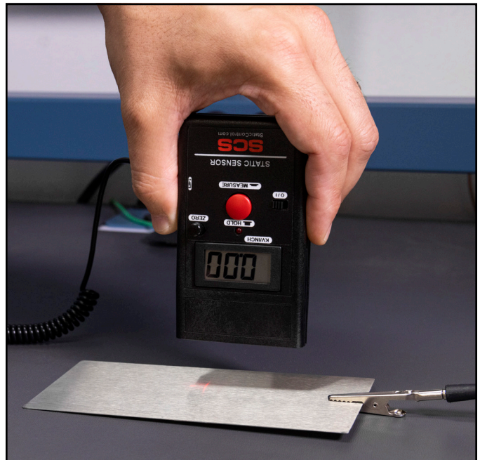
Figure 6. Pointing the Static Sensor to a grounded surface

Slide the power switch to the right to power the Static Sensor. Point the top of the Static Sensor approximately 1 inch (2.5 cm) away from a grounded metal surface. Proper spacing is indicated when the two red bullseyes emitted LED range indicator become centered on top of each other. Turn the rotary zero knob until the Static Sensor's display reads 0.00.