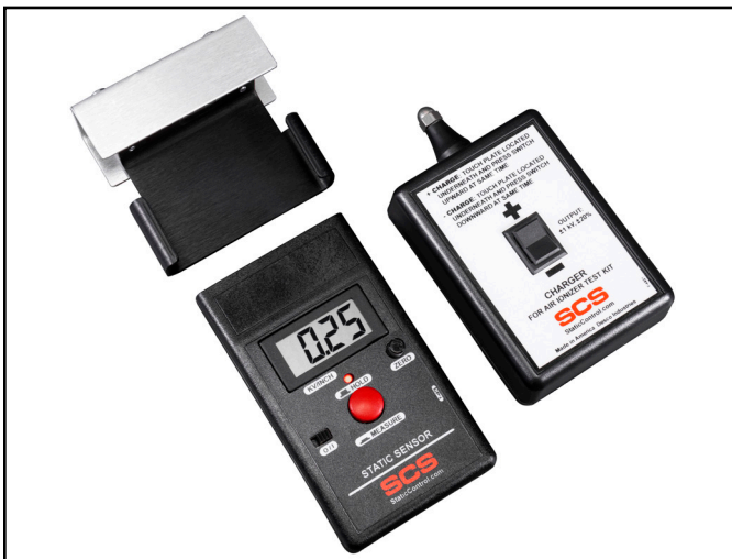
Figure 2. SCS 770717 Air Ionizer Test Kit