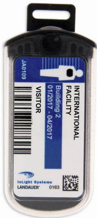
LANDAUER Holder Design