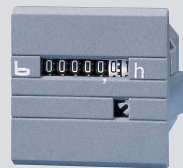
type 631.2, 631.3, 633.2, 633.3, 629.2, 629.3, 637.2, 637.3