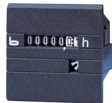
type 632.2, 632.3, 634.2, 634.3, 630.2, 630.3, 638.2, 638.3