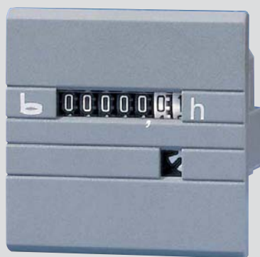
type 631, 631.1, 633, 633.1, 629, 629.1, 637, 637.1