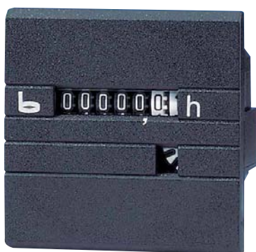
type 632, 632.1, 634, 634.1, 630, 630.1, 638, 638.1