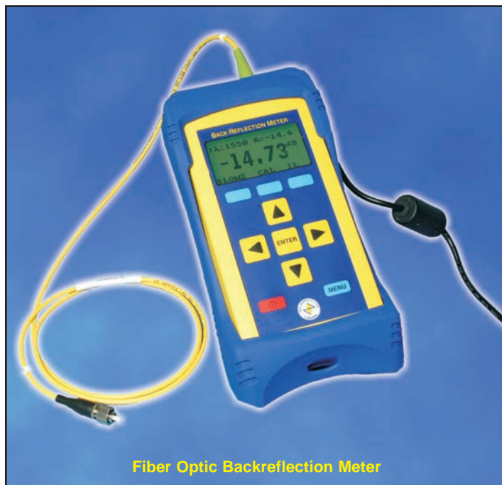
Fiber Optic Backreflection Meter