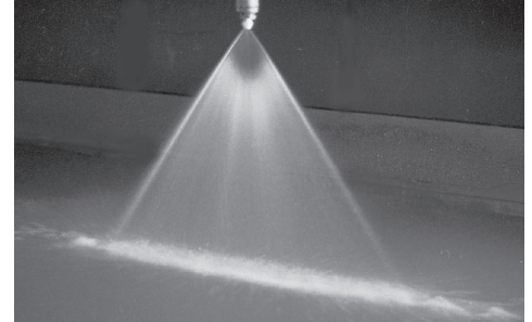
Spray angle not exactly as shown