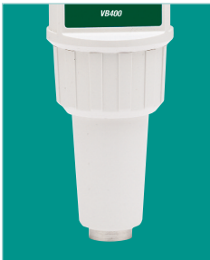
Magnetic base included