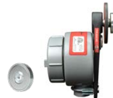
MM-2.00 Mounting Magnet Option (must be used with EZ-SCP)