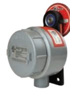
EZ-SCP Mounting Option