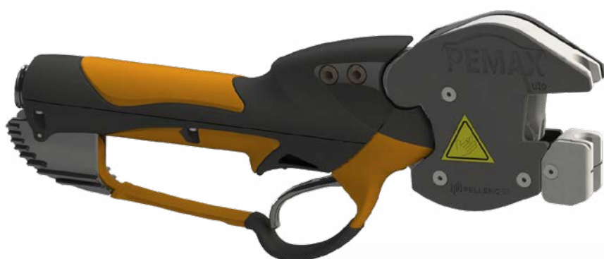
CLAMP FOR INSERTION OF HINGE PINS

«Portable electric clamps for the Automotive Industry»