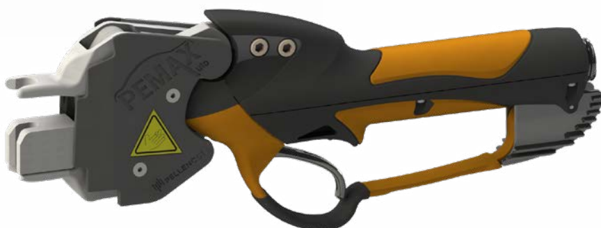
CLAMP FOR EXTRACTION OF HINGE PINS