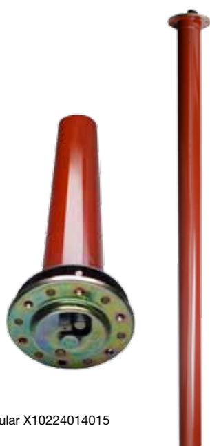
Sender- Tubular X10224014015