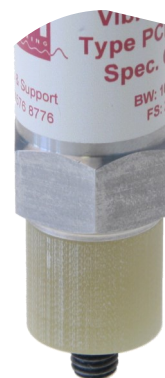
CHA 1012 HT adaptor and isolator