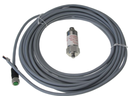
PCH 1106 Mk2 with cable