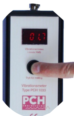
PCH 1033 Vibration Meter